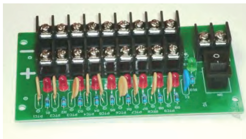
Fig 1: Optional Distribution board